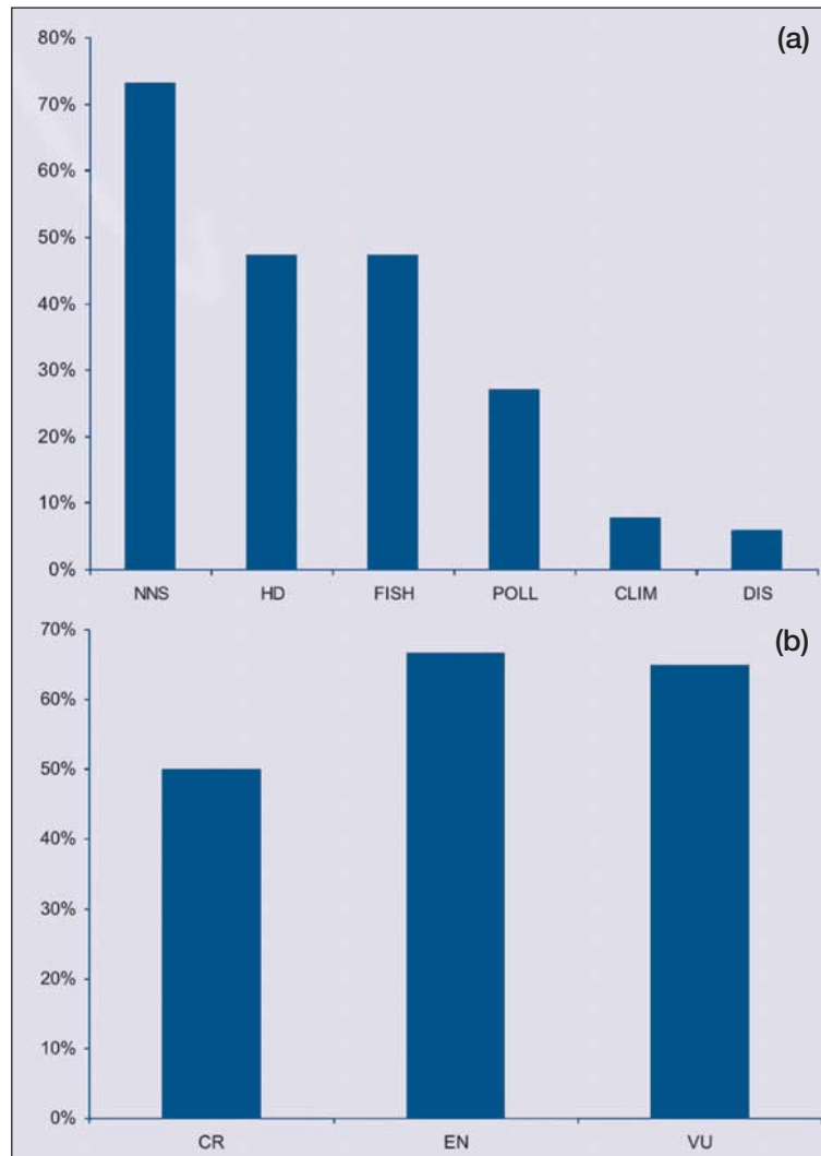
Figure 2. (a) Threats to seabirds listed by the IUCN: non-native species (NNS), habitat destruction and/or direct persecution (HD), fisheries bycatch and competition for resources (FISH), pollution, including hydrocarbons, plastics, and light (POLL), climate change (CLIM), and disease (DIS). Many species are experiencing multiple threats. Includes all seabirds listed as critically endangered, endangered, vulnerable, and extinct. (b) Percent of seabirds listed by the IUCN that are explicitly threatened by fisheries bycatch at sea and also by non-native species on breeding islands. Includes all seabirds listed as critically endangered (CR), endangered (EN), and vulnerable (VU). Data from Birdlife International's World Bird Database, n = 104 .

Conservation actions also differ over the time period